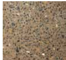
tan concrete aggregate semi-rough