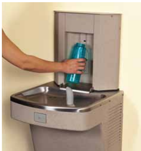
Powdercoated, galvanized steel

Works with A111, A112 (pg. 6), A171, A172 (pg 7) Series Water Coolers.